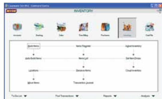
Easily manage your inventory