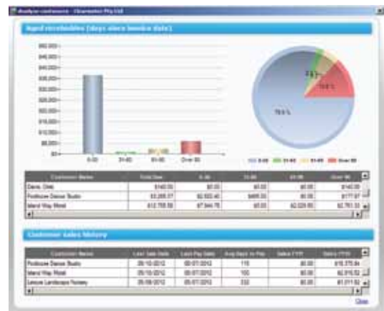
Quickly view your financial position