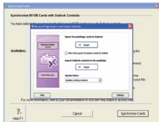
Effectively manage your customers